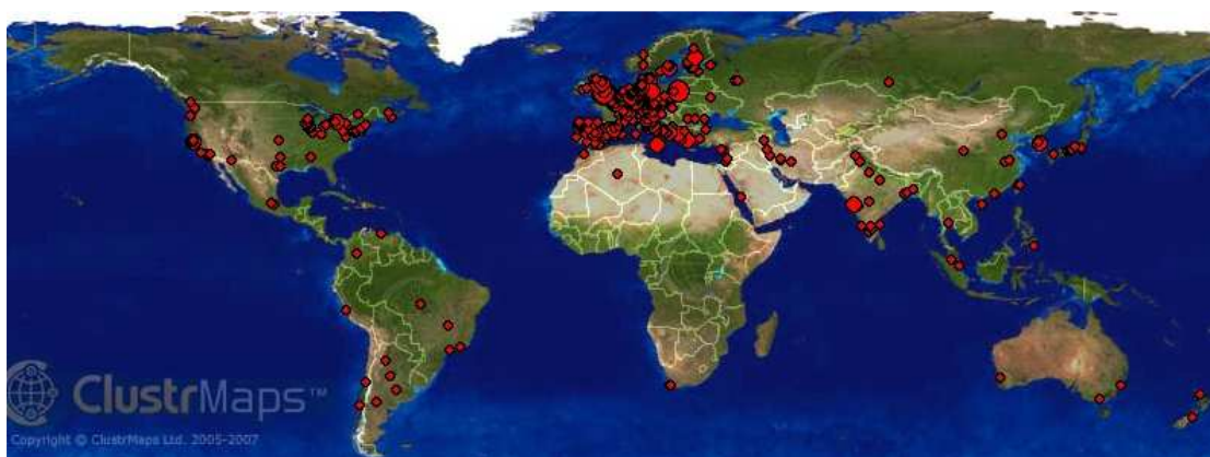
Figure 2: UniverseNet website visits from around the world. The origin of 3,669 hits for the year 6 April 2007 to 6 April 2008 are shown.