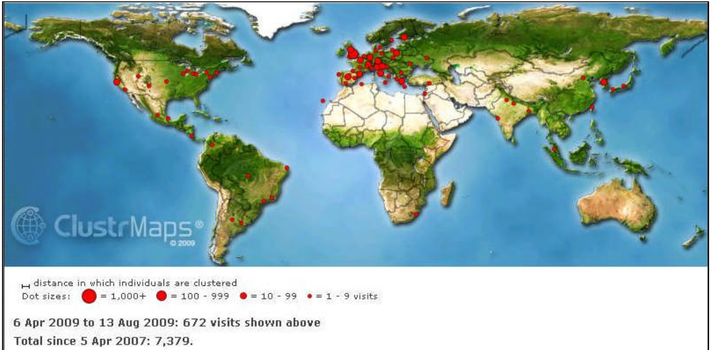
Figure 3: UniverseNet website visits from around the world. The origin of a further 672 hits for the period 6 April 2009 to 13 August 2009 are shown.